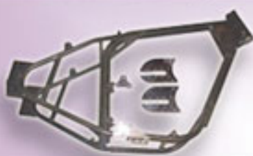
FRAMES: Modern and Vintage